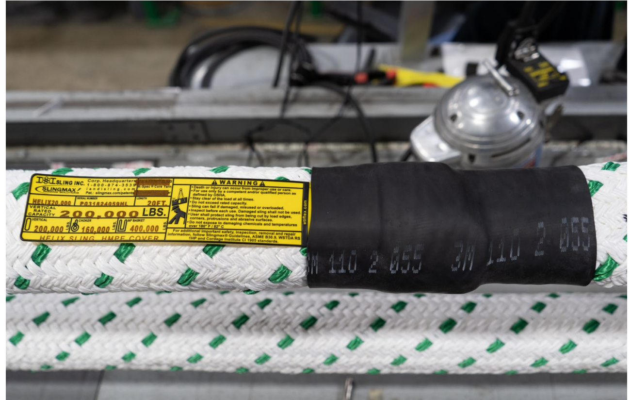
Utilizing strong 3M rubber shrink tube to close the sling and secure the Etiflex tag