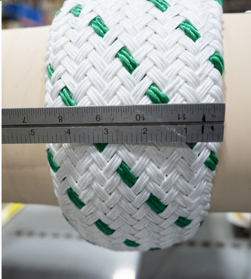
5inch sling width: 200K Vertical Capacity